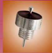
Filter incorporating Transient Voltage Suppression (TVS)