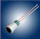
Sub-Miniature Cone lock