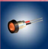
Panel Sealed Indicators