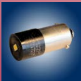
BA9 Bulb Replacements