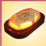
Anti Collision Lights