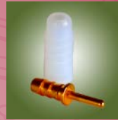
Plugs & Sockets