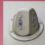
IR Formation Lights