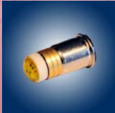
T1 3/4 Bulb Replacements