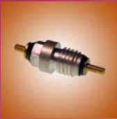
Single Line Filters