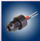
Rear Mounting Indicators