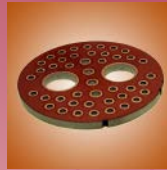
Planar Capacitor Array