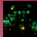
NVIS Cockpit Upgrades