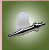
Barb Cone Lock