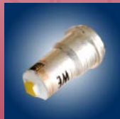
T1 Bulb Replacements