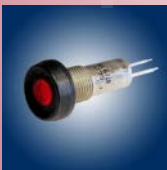
Panel and Body Sealed Indicators