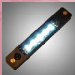
Mini Flood Lights